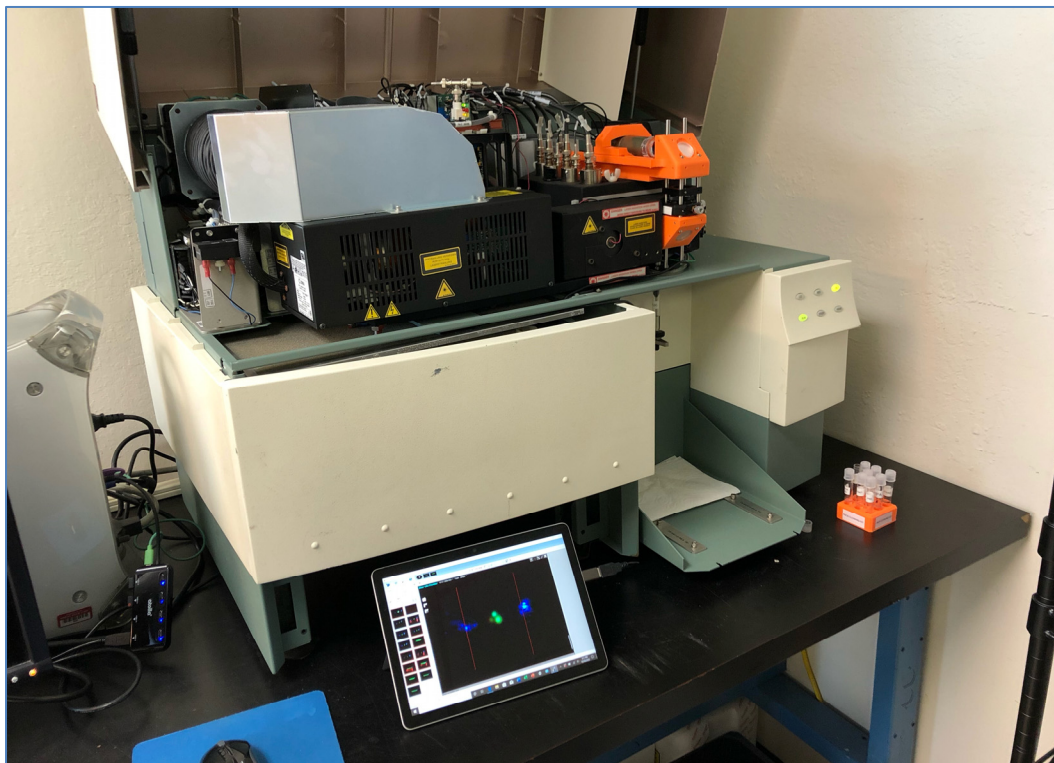
A Cavour installed on a BD FACSCalibur™