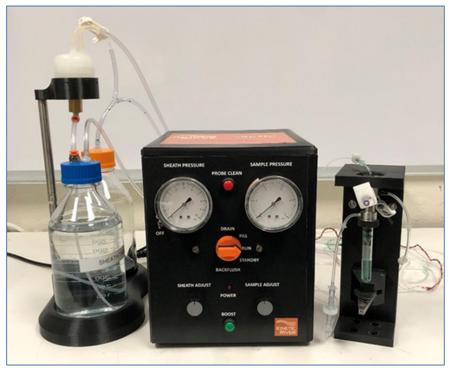
A Shasta Fluidics Control Module installed at the University of California, Davis

The Shasta module can support unlimited essentially flow rate requirements. For specialized applications such nanoparticle as detection, the Shasta provides highly stable ultra-slow flow rates which can increase dwell time by two- to twentyfold. Pneumatic pumps provide constant pressure throughout the system, and dual stage regulation of both the sheath pressure and the sample pressure provides stability and a broad and fully adjustable operating range for the user. Built-in functions, such as probe clean, sample boost, and automatic venting increase functionality. A custom designed, 3D printed enclosure gives a sleek look and feel for the system while allowing easy access to internal components for later upgrades or maintenance.